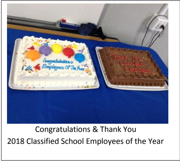
Congratulations & Thank You 2018 Classified School Employees of the Year